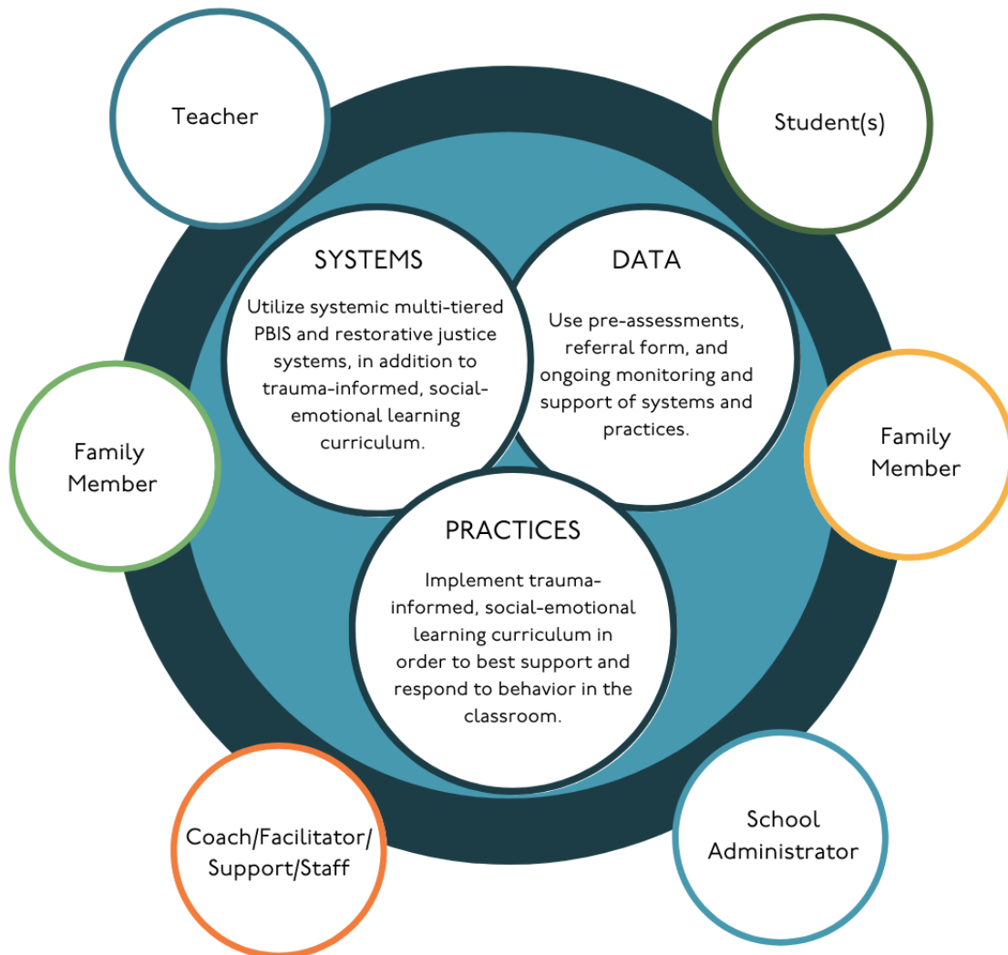
Figure I. Trauma-Informed Practice: Elements and Outcomes

It is clear that trauma-informed practices, SEL and PBIS can lead to positive outcomes for students, but how do we think about implementation, evaluation, and sustainability? The three pillars of behavioral and academic achievement are the synchronicity between data, systems, and practices (shown below in figure I). Data helps inform systems and practices and daily practices actively reflect the systems chosen. The systems and practices should all root back to data and continue to be re-evaluated and assessed.